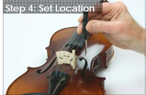
Hold the sound post setter vertically over the instrument with the sound post over the setting location and the tube of the setter over the f-hole. Loosen the sound post slightly and rotate the sound post in the setter so the angles on the top and bottom match the curvature of the top and back. Re-tighten the sound post. Note the position of the setter as this will be the position you will match when setting the post.