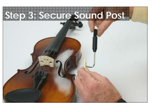
Pull the line to tighten it around the sound post and tighten the thumb screw snugly to hold it in place.