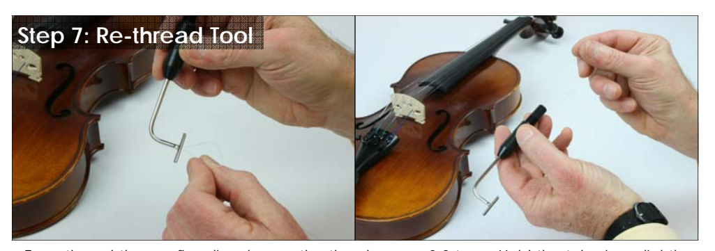
To re-thread the confiner line, loosen the thumb screw 2-3 turns. Hold the tube in a slightly downward position and thread the free end of the line into the empty hole and push through the body of the sound post setting tool.

ADDITIONAL NOTES: When the tool is not in use, release the tension on the thumb screw. This will prolong the life of the tool. When necessary line can be replaced with any monofilament line you find that threads through the sound post setter. Approximately 10LB test.