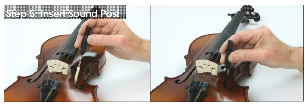
With the sound post now securely in the setter, carefully insert the sound post and setter through the f-hole and work the sound post into position holding it vertically and gently pulling the sound post towards you until you feel it wedge into position.