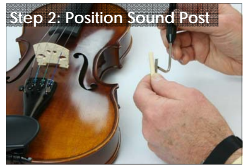
Position the sound post in the cradle and hold it in position.