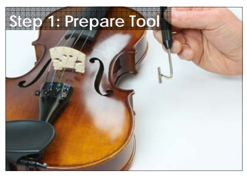
Check to see that both ends of the confiner line are threaded through the setter forming a loop around the sound post saddle. Loosen the thumb screw to allow the line to move freely.